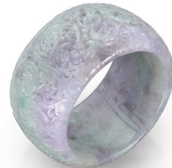
Carved lavender and green jadeite bangle.